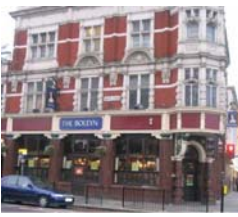
The Boleyn... great beer and great memories.

Doc Martin Boots, Fred Perry Shirts and my old Granddad sneaking me sips of lager at the Boleyn Tavern on the corner of Green St & Barking Rd. That's what my first football memories are of West Ham United. West Ham United, also known as The Irons or Hammers, were formed in 1895 and have a colorful history. The academy of football has populated many England squads over the years and two of it's most beloved players helped England win their one and only World Cup in 1966.